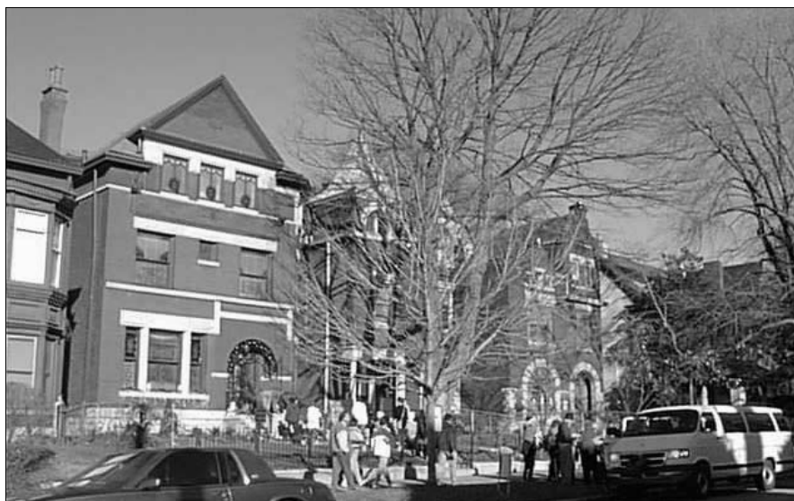
An estimated 2,500 people enjoyed walking the streets of