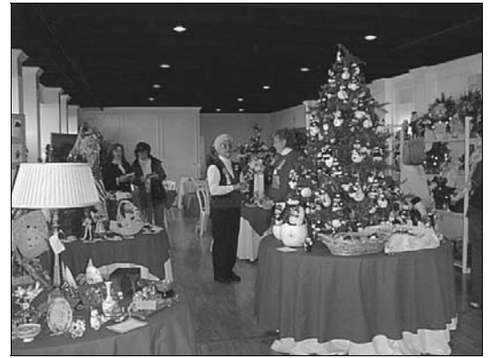
The Victorian Yuletide House Tour included a wonderful Holiday Gift Boutique and a Complimentary Shuttle Service throughout the tour.